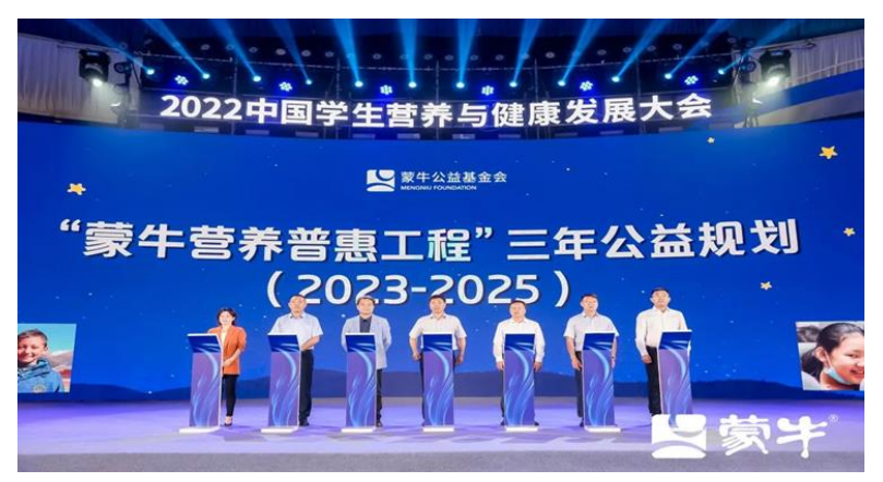
2022 China Student Nutrition and Health Development Conference

In 2022, Mengniu continued to practice public welfare activities, with student milk donation as the focus, adhering to its mission that "every drop of nutrition makes every life thrive." Through activities such as the Future Star Student Assistance Program and the One Cent Donation Project, Mengniu conducted the Milk Donation Program of Inclusive Nutrition Plan in 277 schools in 58 cities of 20 provinces across the country, donating more than 3.97 million boxes of milk with 179,200 servings of milk for students. At the "2022 China Student Nutrition and Health Development Conference," Mengniu pledged to donate student milk valued at RMB30 million to schools nationwide in the next three years. In addition, Mengniu has always been present on the front lines of public welfare activities such as earthquake relief and caring for children and the elderly.